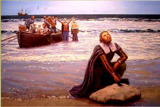
The Pilgrims landing at Plymouth Rock