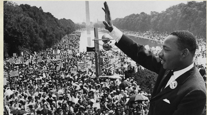
Dr. Martin Luther King at the Lincoln Memorial, August 28, 1963