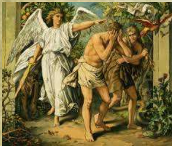
Adam & Eve Cast Out of the Garden Gen 3:8-13