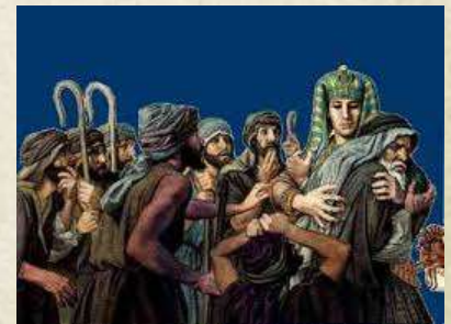
Joseph & His Brothers in Egypt Gen 45