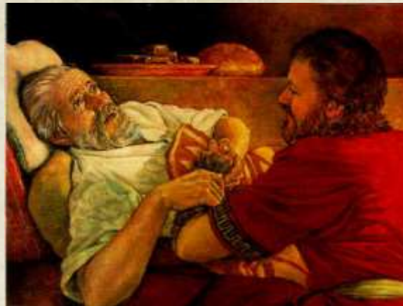
Jacob Steals His Brother's Birthright Gen 27:34, 35