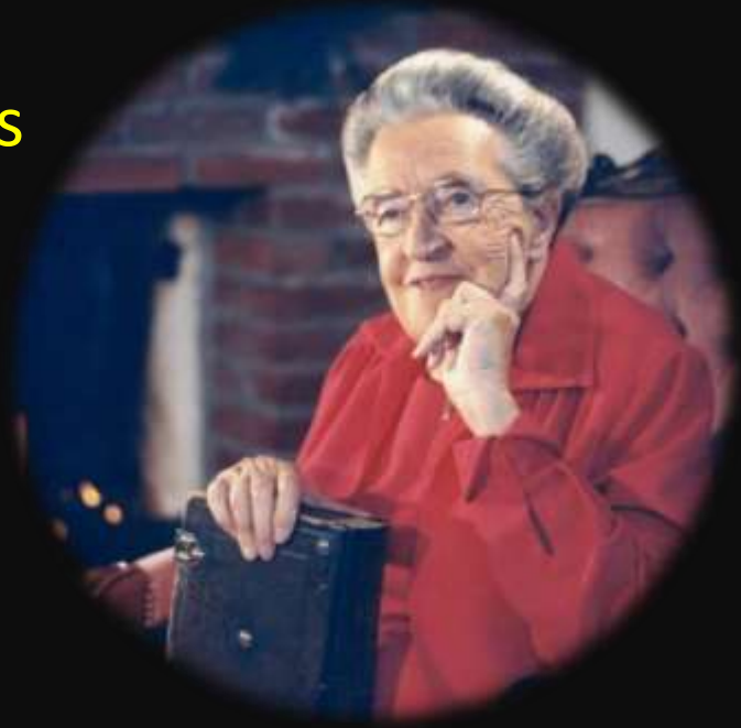
Corrie Ten Boom