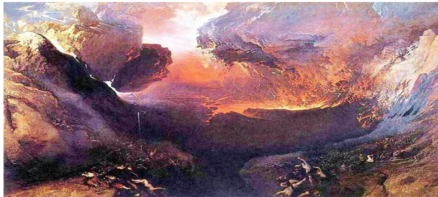
Revelation 6:12-16 (NIV)

15 Then the kings of the earth, the princes, the generals, the rich, the mighty, and everyone else, both slave and free, hid in caves and among the rocks of the mountains. 16 They called to the mountains and the rocks, "Fall on us and hide us from the face of him who sits on the throne and from the wrath of the Lamb! 17 For the great day of their wrath has come, and who can withstand it?"